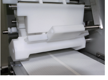
Rice spreading continuously. Rice sheet can be cut by required length.

Cut length is adjustable. The rotary cutter is always kept clean with alcohol.