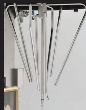
*The multi-angled Stirring Blade (Rice Washing Tank not shown)

The multi-angled design of the Stirring Blade ensures the rice is evenly stirred. The Bran – the hard outer layer of the grains of rice – is quickly and efficiently removed to contribute to efficient rice washing in a remarkably reduced amount of time.