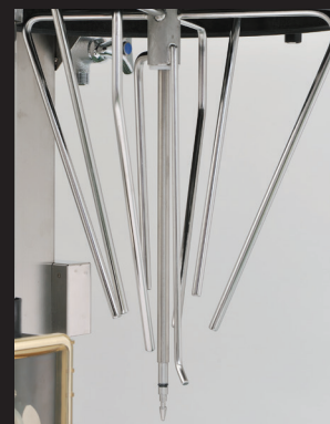
*The multi-angled Stirring Blade (Rice Washing Tank not shown)

The multi-angled design of the Stirring Blade ensures the rice is evenly stirred. The Bran – the hard outer layer of the grains of rice – is quickly and efficiently removed to contribute to efficient rice washing in a remarkably reduced amount of time.